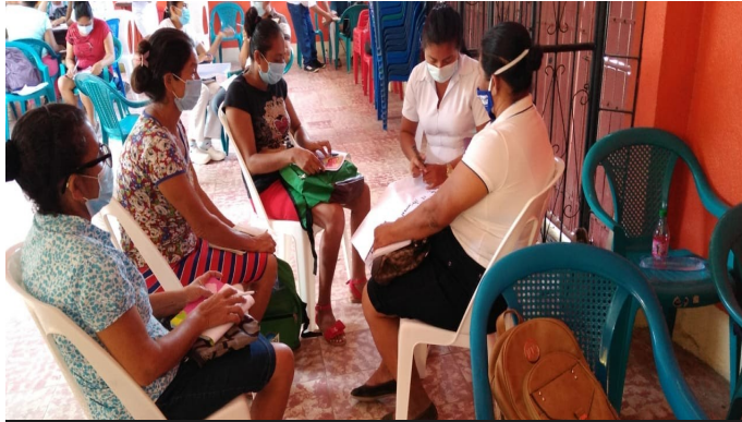
Breakout session during Brigadista training

On the second Wednesday of each month, the Brigdistas from the surrounding communities meet at the Program Center in Villanueva.