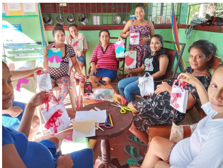
Pregnant women doing crafts at Casa Materna

Several weeks after, we received a healthy check from this parish to support this cause.