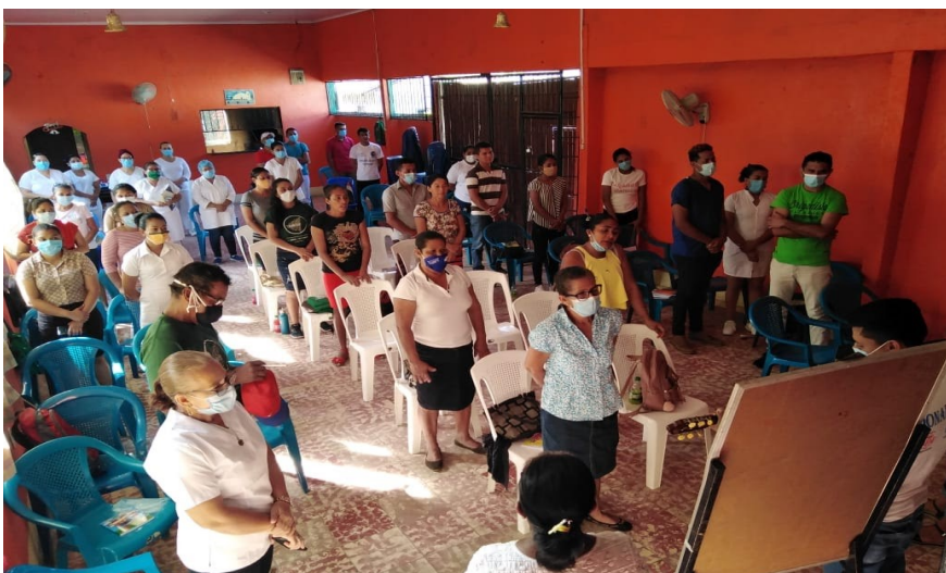
Monthly Brigadista training session .

Hearing the stories of the people of Villanueva, about their families and learning about the discipline of the brigadistas in how they carry out their work, had an impact. People donate when they see the impact of their donations. They place themselves in these pictures and stories and have empathy for the good work being done.