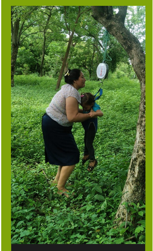
A Brigadista weighing a child in the community of Picaira to ensure appropriate development

The emphasis at the Brigadista center was not just training Brigadistas but a push toward general education of the community on issues such as birth control, etc.